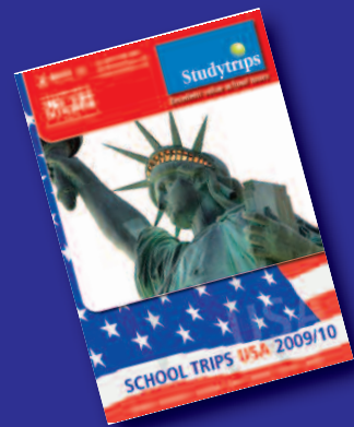
School Trips USA

...to view one of our specialist brochure call 0845 026 4661 or visit online www.studytrips.co.uk