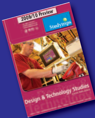
Design & Technology Studies