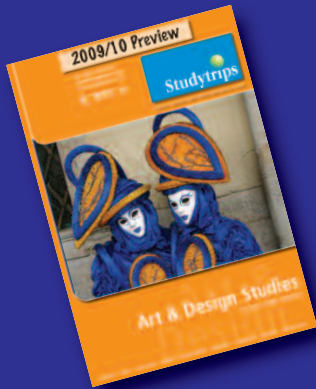
Art & Design Studies