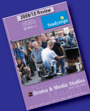
Drama & Media Studies