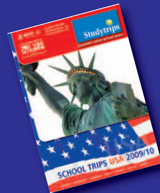
School Trips USA

...to view one of our specialist brochure call 0845 026 4661 or visit online www.studytrips.co.uk