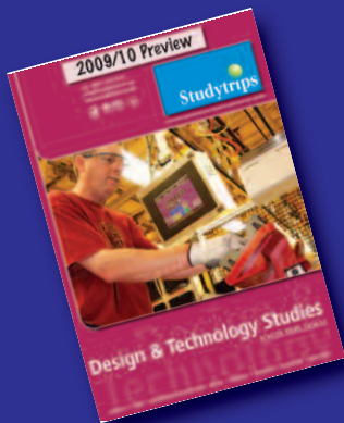
Design & Technology Studies