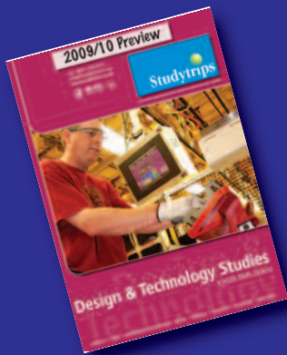
Design & Technology Studies